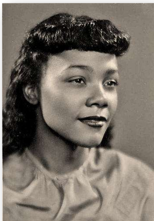
New England Conservatory Application Picture

During her senior year, Coretta learned that she would not be allowed to perform her