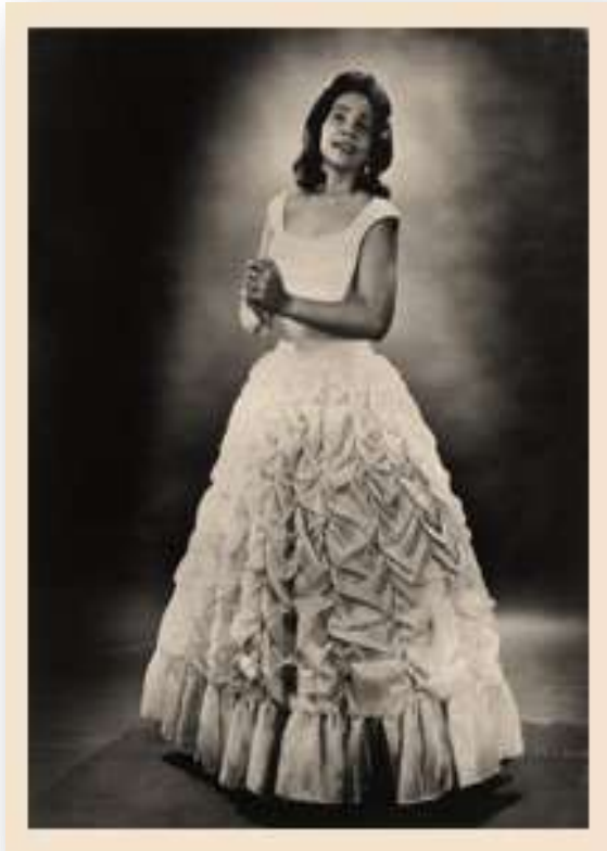
Coretta Scott King Performance Portrait

required practicum at any of the local public schools because the Yellow Springs school system did not allow Black teachers. When the college administration would not intervene—and she refused to teach at a nearby segregated school, she was forced to complete the practice teaching requirement at the college’s laboratory school.