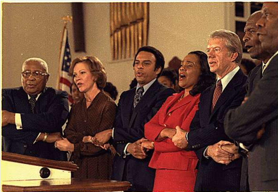
Singing with Martin Luther King, Sr., Rosalynn and Jimmy Carter, Andrew Young and other Civil Rights Leaders, 1979

The Newsweek review of her first Freedom Concert in 1964 seems to sum up this legacy. It stated, "Perhaps here Coretta King's quest had ended. She had at last found a way to bring together her devoutness, her dedication to the civil-rights struggle, her love of music, and her abiding need to serve." ('Come by Here, My Lord' 1964)